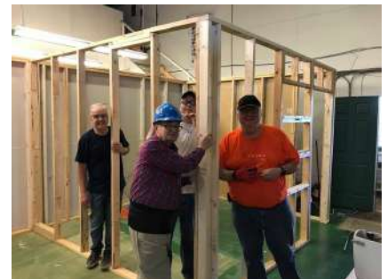
Rotary building our changerooms