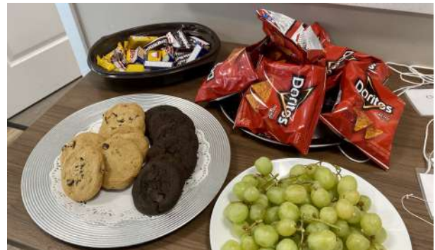
The snacks we put out for the teens in our Good Grief Teen Training Program in November.

**Please note that this is only a partial list of our programs & services.