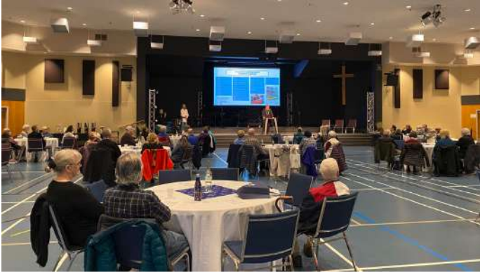
Our Dying to Learn More: Empowered Aging educational event in November.