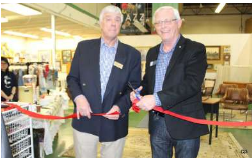
Expansion re-opening sale in 2016