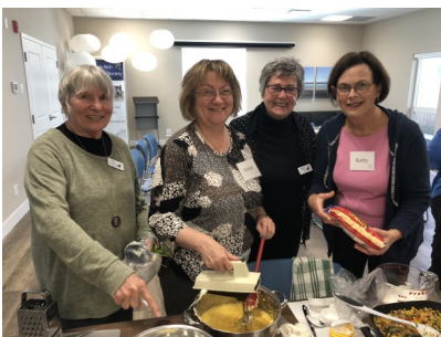
*Photo taken before COVID-19 at our Cooking Together program. This program is currently postponed until it is deemed safe to run again.*