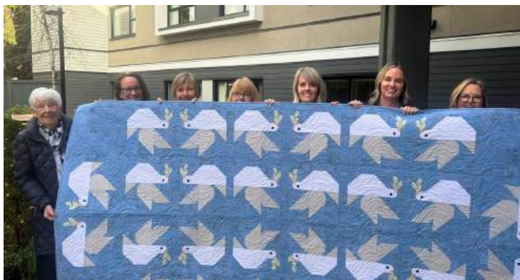
Piece Arch Quilters showcase their talented work on two beautiful bird themed quilts they have lovingly crafted for Melville Hospice Home.