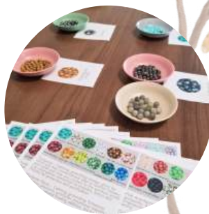
Grief Collages / Zines