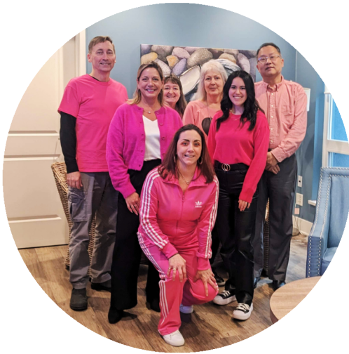
Pink Shirt Day 2024