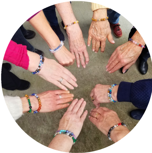
HeARTfelt Mourning: 4 Part Art Series (Memory Bracelets)