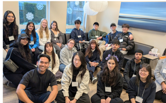
Good Grief Teen Training 2024