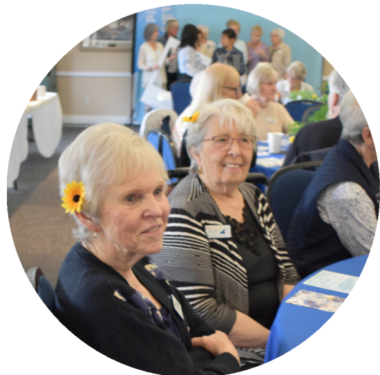
Volunteer Appreciation Brunch 2025