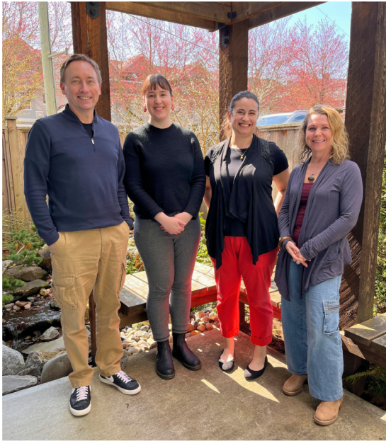
PAHS Clinical Counselling Team