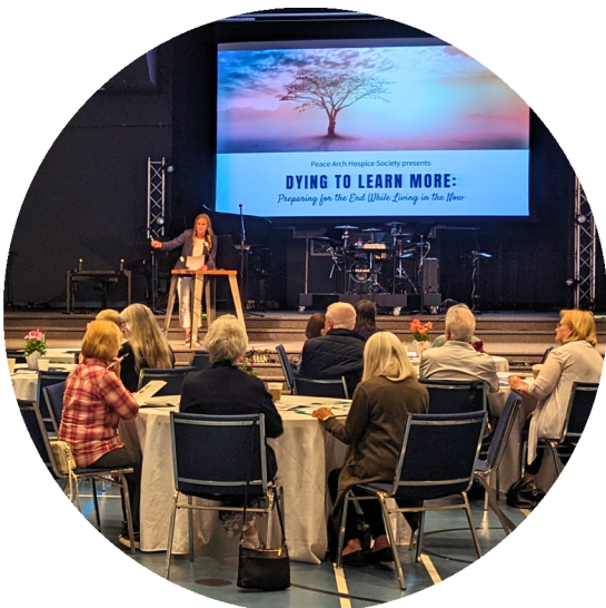
Dying to Learn More 2024