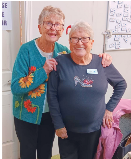
PAHS Thrift Store Volunteers

Peace Arch Hospice Society ...a special kind of caring