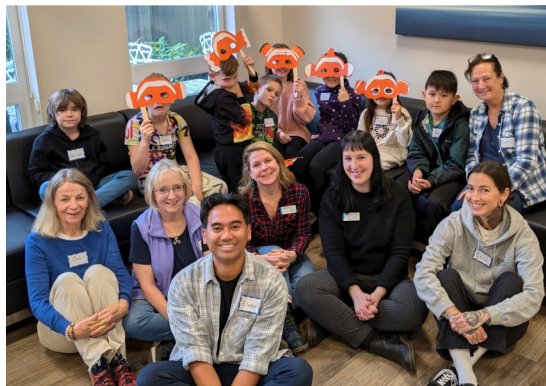
Friends Helping Friends: Children's Grief Camp (Finding Nemo Theme) 2024