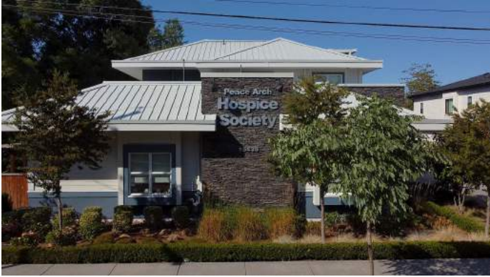
The exterior of our Supportive Care Centre located at 15435—16A Avenue.