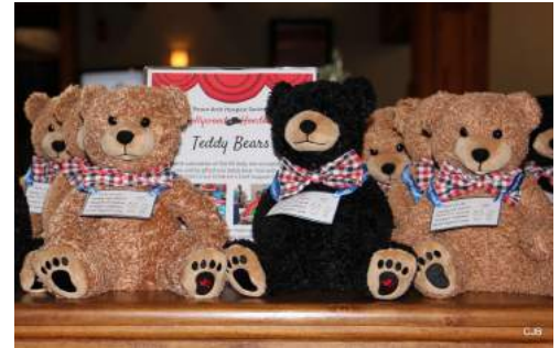
With a donation of $50, donors were gifted a teddy bear, which sends one child to our Children's Grief Support Camp.