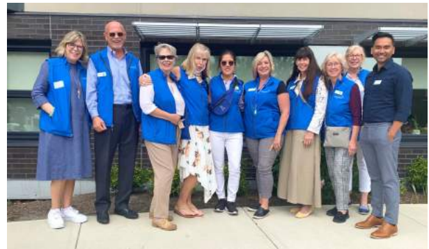
Our group of new, recently trained volunteers outside of the Melville Hospice Home for their orientation.

**Please note that this is only a partial list of our programs & services.