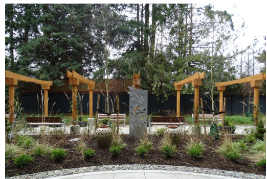
Tranquility Garden at the Melville Hospice Home