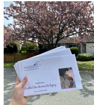
In honour of Mother's Day 2021, we shared the story of one of our clients and the loss of their Mom in a Direct Mail Campaign to raise funds.