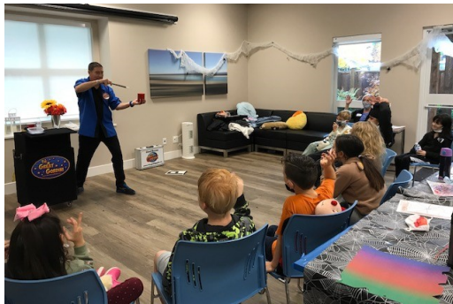
Children's Grief Support Camp: Oct 2021

Strengthen and continue to build partnerships and enduring relationships.