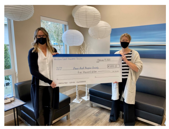
Grant from Western Communities Foundation (Selected by Western Coast Insurance Services)

Due to the high numbers of 'Hands Donors', we are unable to include them all in our Annual Report. We thank you for choosing Peace Arch Hospice Society as the recipient of your generosity and kindness.