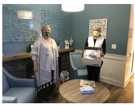
Donation of reusable face masks from "Flatten the Curve Handmade Masks"